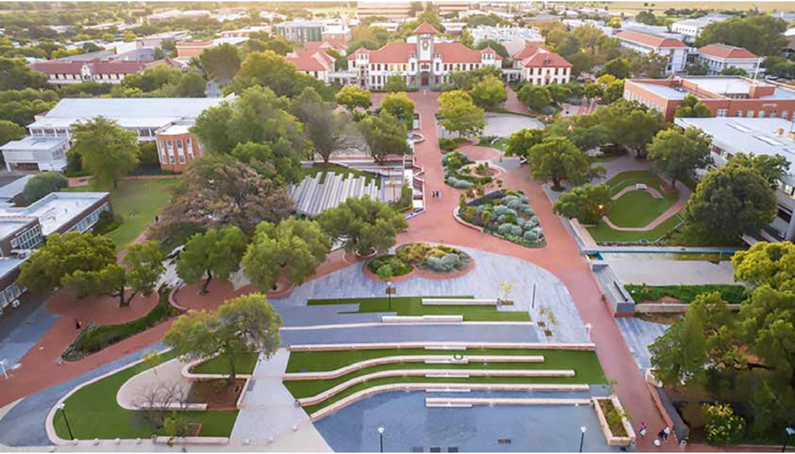
UFS Red Square